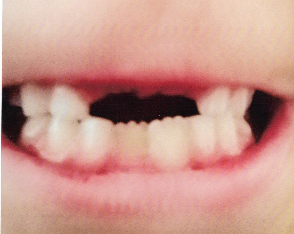
C) Hypomineralisation. A boy of seven years-old.